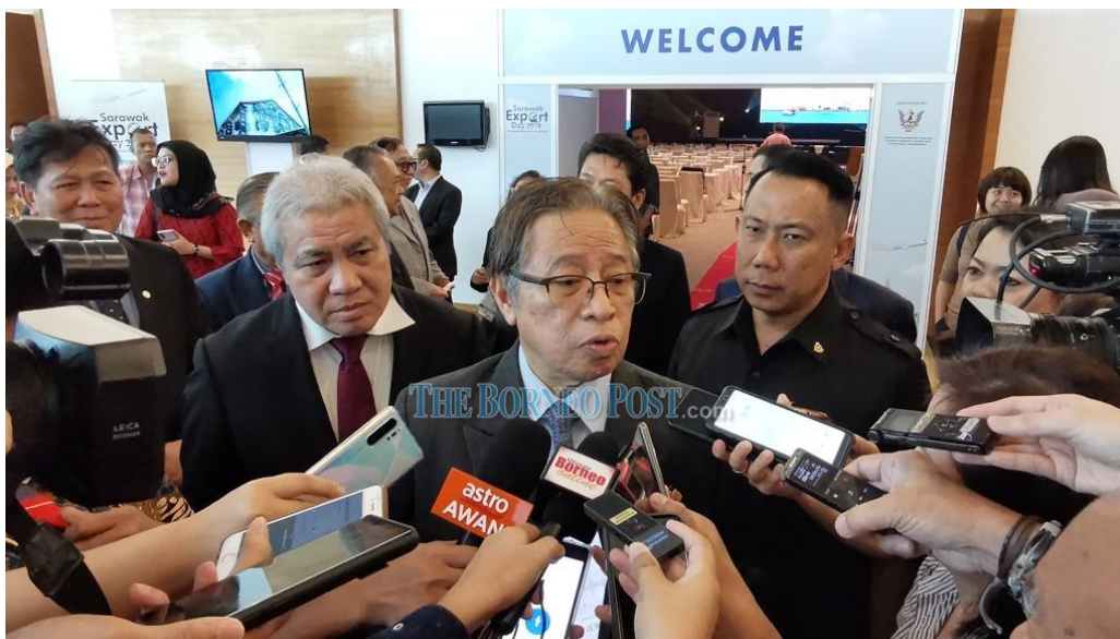
Abang Johari speaks to journalists after the launch of Sarawak Export Day 2019.

KUCHING: The Sarawak government will consolidate the port facilities across the state to better manage the four ports under the jurisdiction of Sarawak.